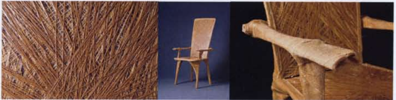
Figure 4.14: Chair by Daan van Rooijen made from bamboo composite and the stem Main processing technologies used: sawing and casting