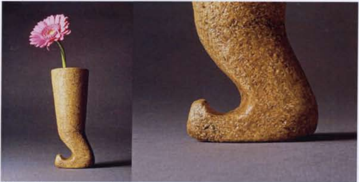
Figure 4.13: Vase by Eliza Noordhoek made from bamboo composite Main processing technologies used: fiber extrusion and casting